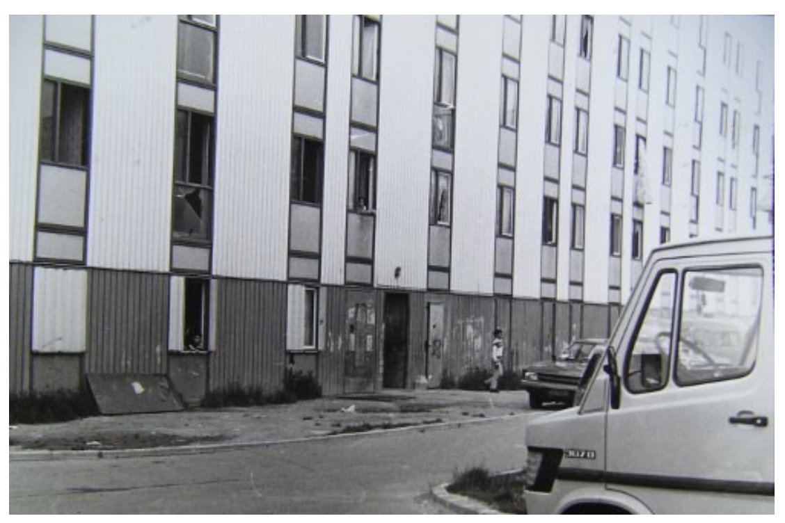
Cité du Pont-de-Bezons (built by Sonacotra, 1972) in Nanterre