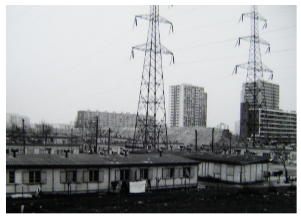
Cité 51 (built by Cetrafa, 1966), along the main road serving the Port of Gennevilliers