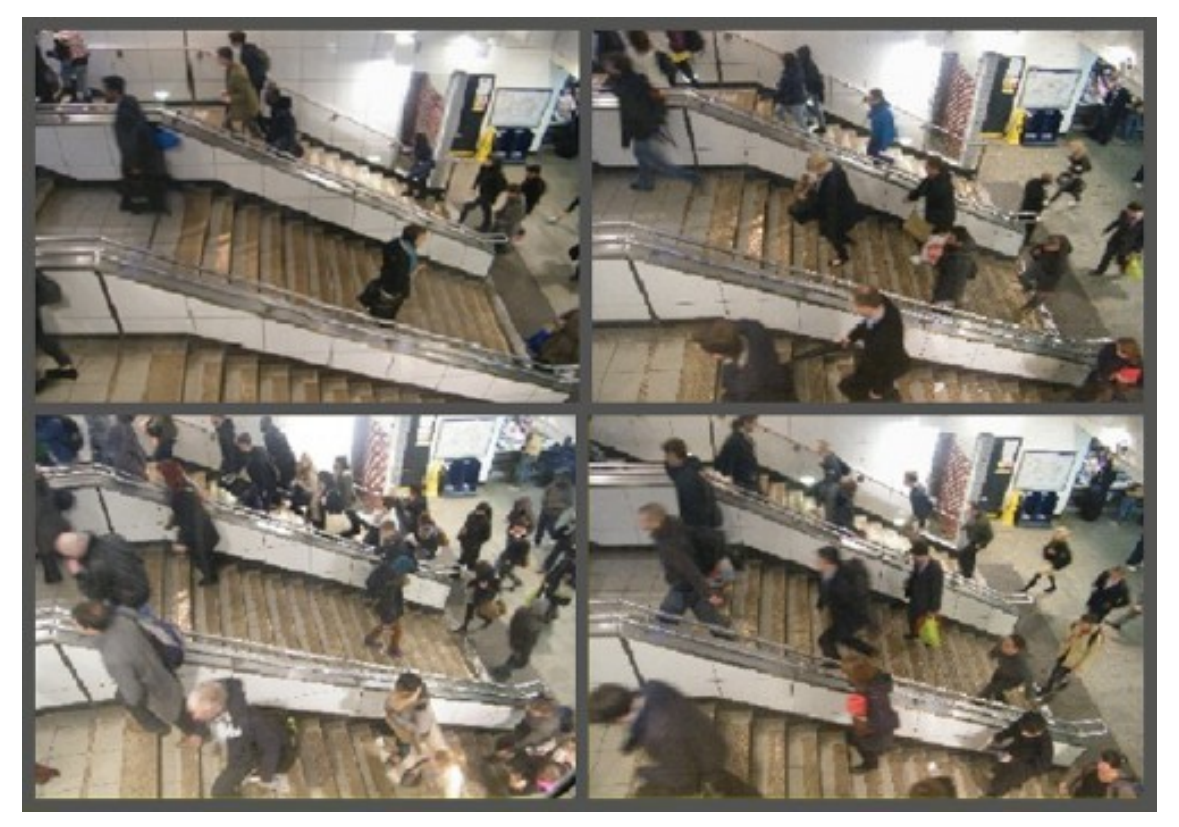
Figure 2. Brixton underground station (Northern Line) on a weekday at 8 a.m.

The Tube is used almost exclusively by residents from higher social classes on their way to work.