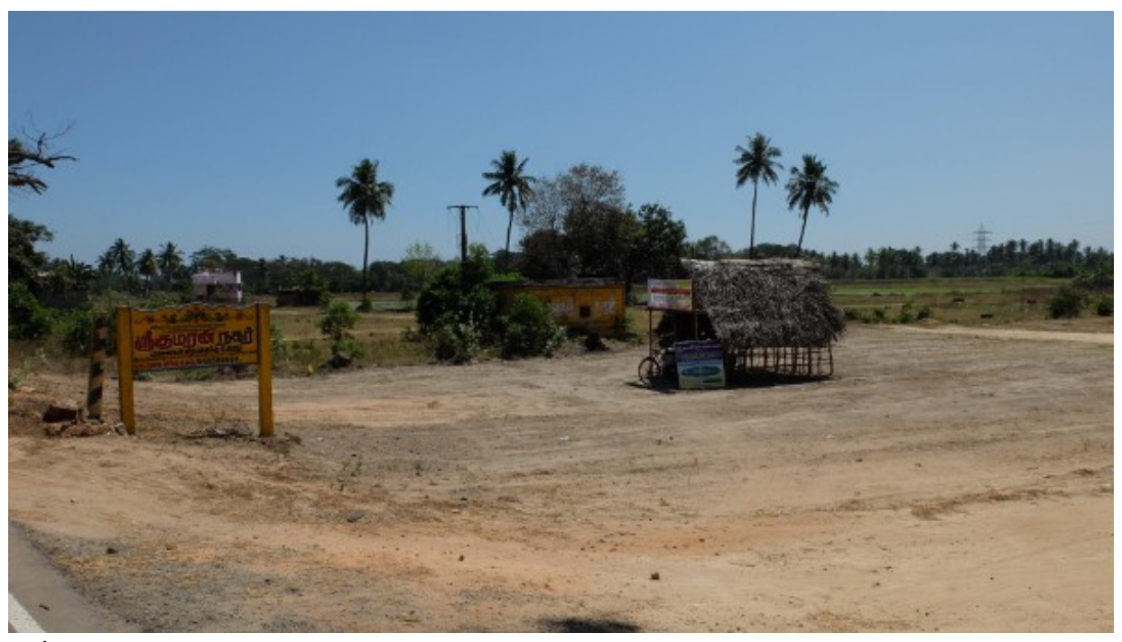
Figure 1. Sale of lots for development, Sri Kumaran Nagar project, Bahour, Puducherry, India, March 2015