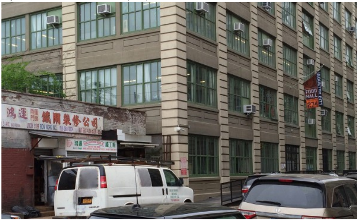
Figure 3. The Food Hall at Industry City

numerous Brooklyn-centric commercial real-estate summits has fed a frenzied and speculative market in Sunset Park.