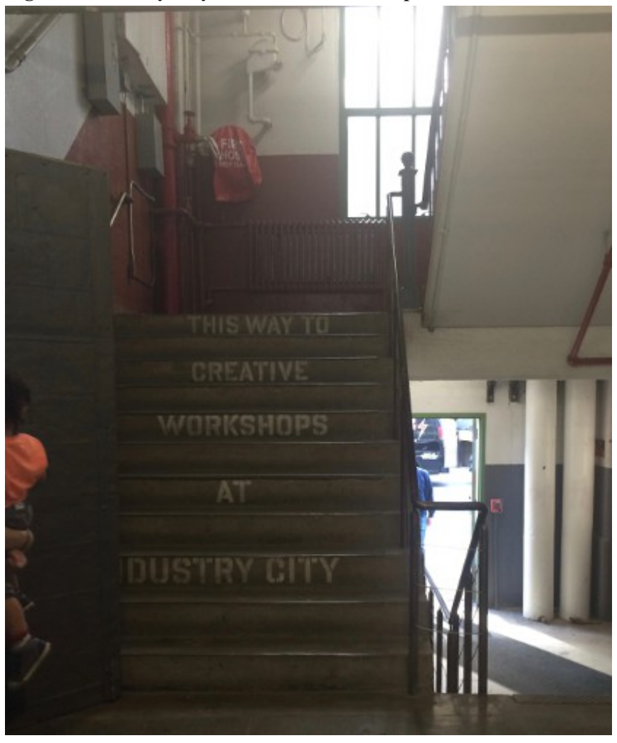
Figure 1. Industry City's "Creative Workshops"