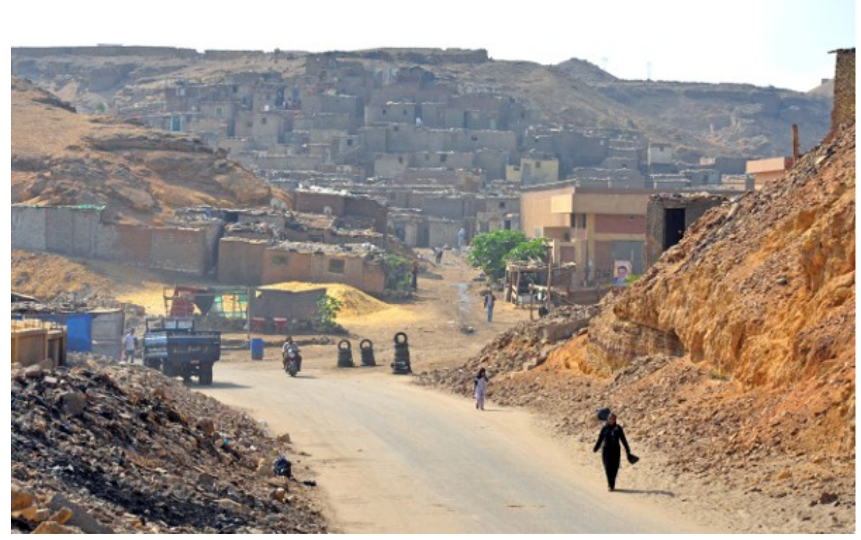
Figure 2. Manshiyyat Nāşir, 2016