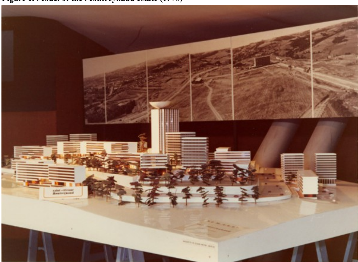
Figure 1. Model of the Montreynaud estate (1970)

"Saint-Étienne demain" ("Saint-Étienne tomorrow") exhibition at the city's economic fair. This exhibition showed off the major urbanistic operations that were under way in the city, demonstrating "the transformations and new face of the city," with the aim of shaking off Saint-Étienne's reputation as a "smoke-blackened industrial city still stuck in the 19<sup>th</sup> century". The exhibition was part of a publicity campaign orchestrated by Michel Durafour, mayor of Saint-Étienne from 1964 to 1977. From 1973 onwards, photo and film² reports focused on Montreynaud (up to 4,400 dwellings planned) and, in particular, its centrepiece tower, Plein-Ciel (by architect Raymond Martin), with its striking verticality (18 storeys), the water tower that gives the building its distinctive bowl-shaped "hat", and its hilltop location that sets it apart (physically and figuratively) from the historic city centre.