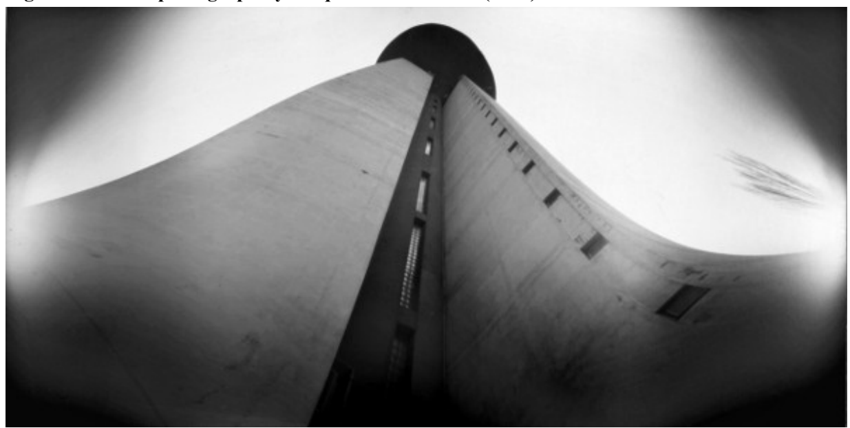
Figure 5. Pinhole photograph by Jacques Prud'homme (2009)

Credit: Jacques Prud'homme, 2009<sup>15</sup>.