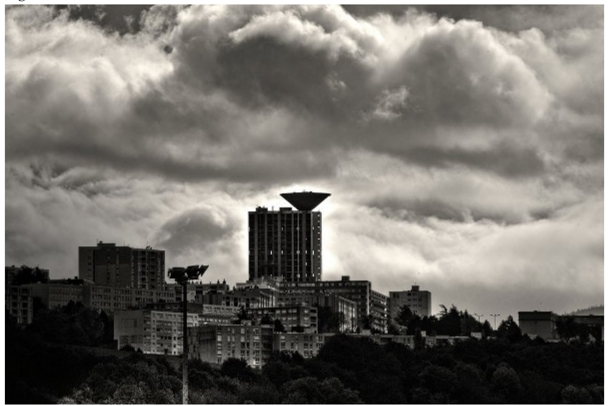
Figure 3. The Plein-Ciel tower "undressed"