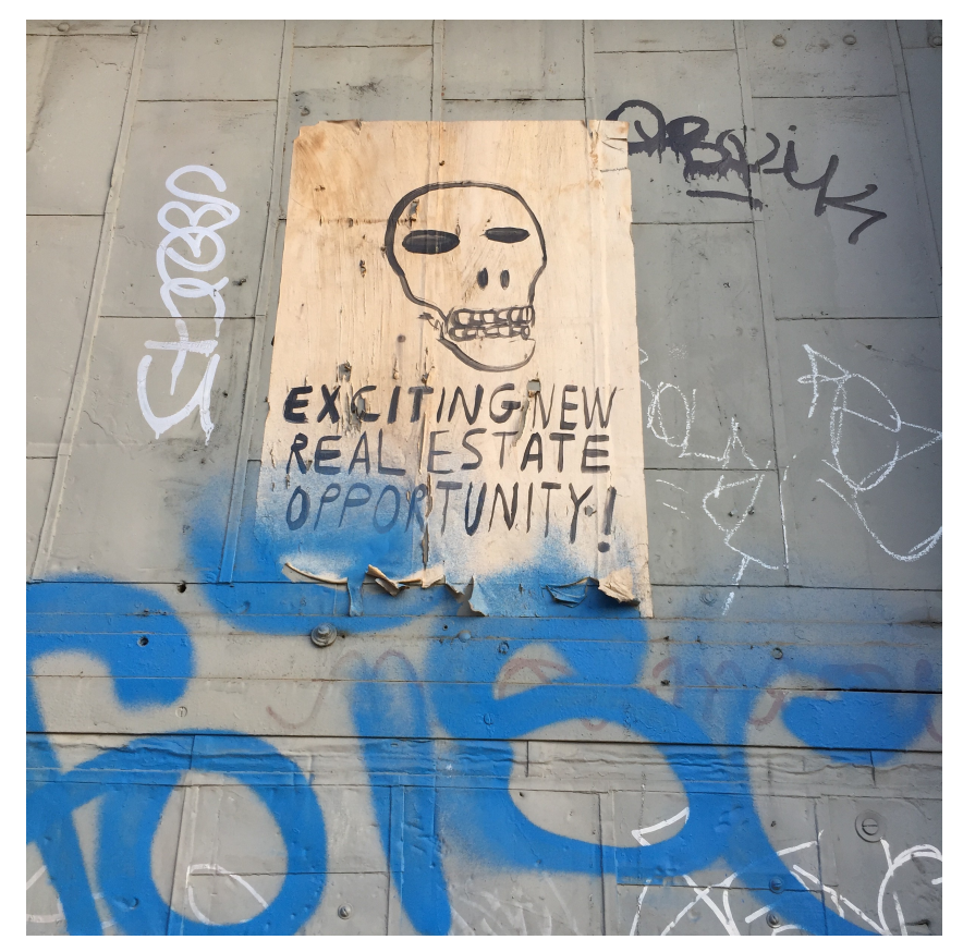
Anti-gentrification graffiti in Bushwick, Brooklyn, 2015