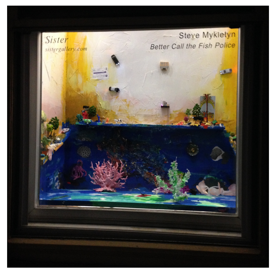
View of Sister window gallery from sidewalk at night, Bushwick, Brooklyn, 2016

Hood Gallery, founded by artist-curator Tom Koehler in 2013, assiduously disrupts the staid white-cube paradigm. It is located in an alley off a traffic-clogged street surrounded by neighborhood businesses—bodegas, discount stores, and an army-recruiting center. Hood Gallery is a shipping container, a corrugated metal box used to store and transfer materials, that Koehler built and financed. It is dry-walled and wired with electricity, but the rectangular metal structure and plywood floor make it feel more like you are stepping into the back of a semi-trailer rather than a standard gallery. Hood is narrow—9 feet (2.7 m) wide by 20 feet (6 m) long—and people linger outside during openings, leaning against and resting their drinks on a garbage dumpster. There is no heat, so they light a fire in a trashcan during the winter.