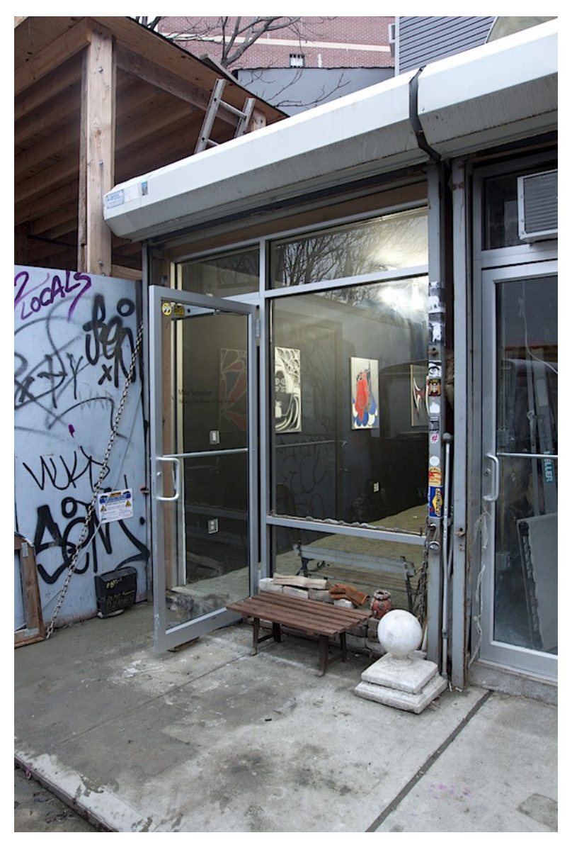
Hood Gallery, located in a shipping container in an alley between buildings, Bushwick, Brooklyn, 2016

An artist who runs an exhibition space in Brooklyn, said: "I like to think of these scenes as motorcycle chapters—certain crews are cool with each other and help each other out, like separate but connected gangs. But we're friendly and they have my respect." There is camaraderie among artists that make work, curate shows and regularly attend openings at artist-run spaces like Hood and Sister. They are a cohort of urban cultural producers with minimal financial support and little formal critical attention to buoy their work. As a practicing artist-curator who works seven days a week making art and making rent differentiates, "We are not part of the scene, we are the scene, and we carry it on our backs."