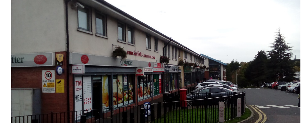
Figure 1. The use value of the interface

A Peacebuilding Plan was then facilitated by a community development NGO and identified the derelict commercial block, burnt-out houses, and vacant land that formed the interface as a potential site for a capital development project. Investment by the EU PEACE program and a US philanthropist of around £4 million was supported by a decade-long community development process that faced down intimidation by increasingly criminalized, misogynistic paramilitary remnants within the Loyalist community (Knox and Quirk 2016). The process resulted in a new entity, the Stewartstown Road Regeneration Project (SRRP), which was constituted as a social enterprise, with four representatives from each community forum and four independent board members. Satisfied with the accountability and representativeness of the governance structure, the state housing authority transferred ownership at nil value of the derelict commercial block and related lands to the group. The result in figure 1 shows the somewhat unremarkable commercial frontage and the childcare center at the end of the block, but it is well used by people from both communities for services, decent jobs, and for the profit it reinvests in each neighborhood. That property rights were bestowed by the state to the community and that ownership enabled the SRRP to create rentier surplus is a troubling one for those who see use value inevitably compromised by entanglements with state and private markets (see Defourny and Nyssens 2014).