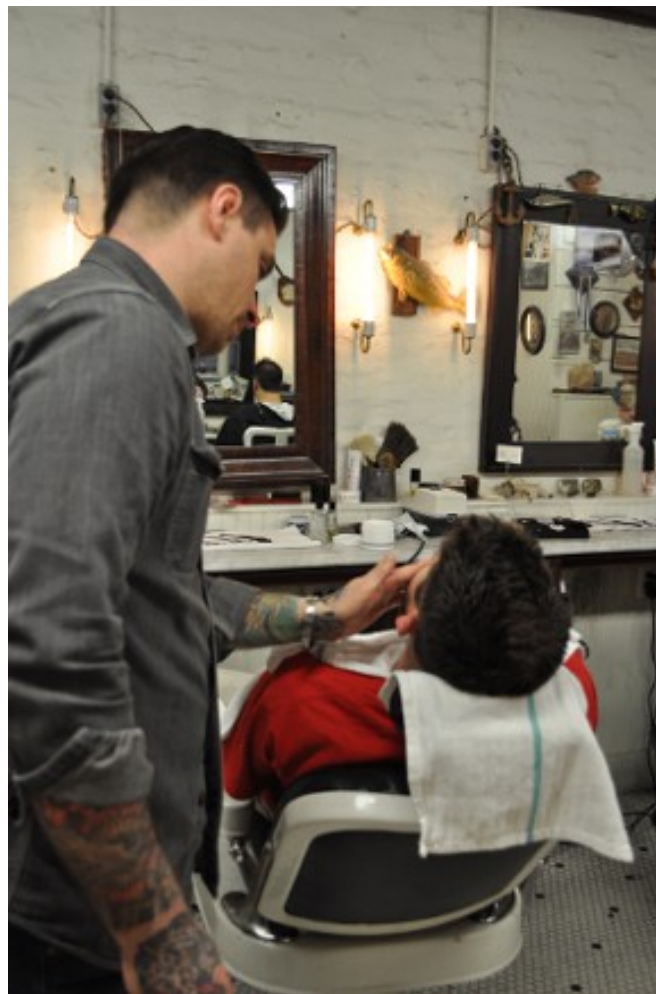
A barber preparing to shave a client

As in the industrial era, new businesses open in today’s gentrifying or gentrified neighborhoods to serve the local community, whose members often possess discerning, omnivorous tastes and senses of style. The most successful of these neighborhoods and businesses acquire reputations as destinations (Ocejo 2014b; Zukin 2010). Cocktail bars, upscale men’s barbershops, and whole-animal butcher shops draw on the romantic imagery of classic community institutions and strive to provide products and services for their neighbors. At the same time, however, they also promote themselves as destinations for curious or “in-the-know” consumers and for members of their industries’ rarefied taste communities (Ferguson 1998). Meanwhile, as examples of the city’s “old order” of luxury consumption and service struggle to survive (opera houses), renovate to adapt (high-end hotels), and disappear (French restaurants) in today’s economy and era of taste, these new establishments increasingly occupy their former positions among the cultural elite, and pressure them into changing (e.g. upgrade their cocktail program, incorporate local meat onto their menus).