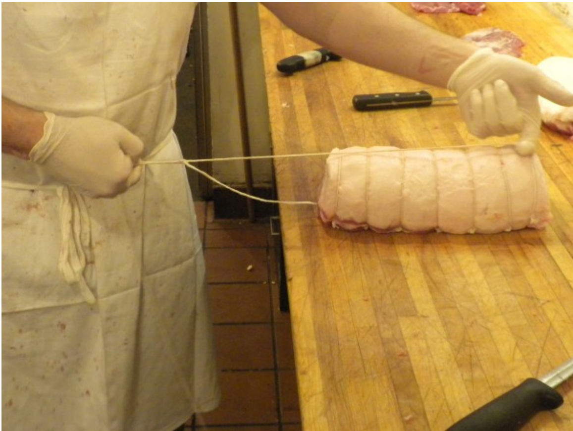
A butcher tying a roast