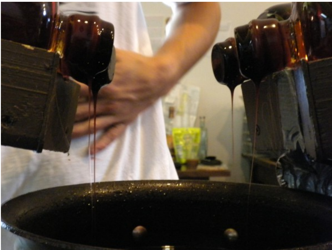
Sealing wax dripping from the bottles’ corks after getting dipped

cocktail bars, microdistilleries, upscale men’s barbershops, and whole-animal butcher shops is the practice and promotion of a sense of craft and expansion of work roles outside the brick-and-mortar establishments. Unlike typical versions of these occupations, workers in these upscale workplaces devote themselves to acquiring both the skills of the trade and the cultural knowledge of the taste community to forge a unique career in their industry. With these skills and knowledge, these workers become valuable as consultants, freelancers, educators, and advocates for their profession and industry. These jobs go from being undesired and external to the new economy to being “cool” and among the professions making cultural innovations within the new economy. As a result, people—mostly men—with college backgrounds and these cultural understandings pursue these masculine-coded jobs as careers despite having other options in the labor market. For them, these jobs are vocations, providing meaning through materially oriented, craft-based service and light manufacturing work (as opposed to the immateriality of the equally male-dominated finance and IT industries). While these new businesses do not displace existing ones, they usually do not provide opportunity structures for the latter’s less-educated practitioners to achieve higher status.