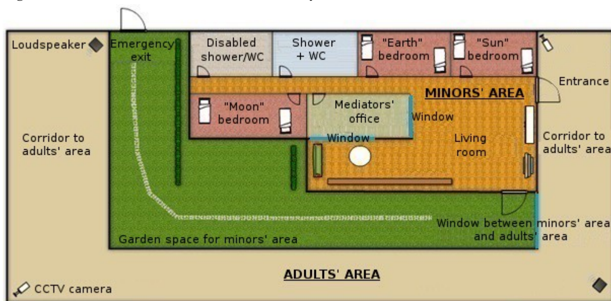
Figure 2. Plan of the minors’ area, surrounded by the adults’ area

The minors’ area is fitted out in such a way that minors perceive a light, soothing atmosphere as soon as they arrive. This space is a micro-world of its own within the holding centre (see Figure 2 below), and reflects an attempt to demarcate it from the surrounding environment, even though both are relatively permeable.