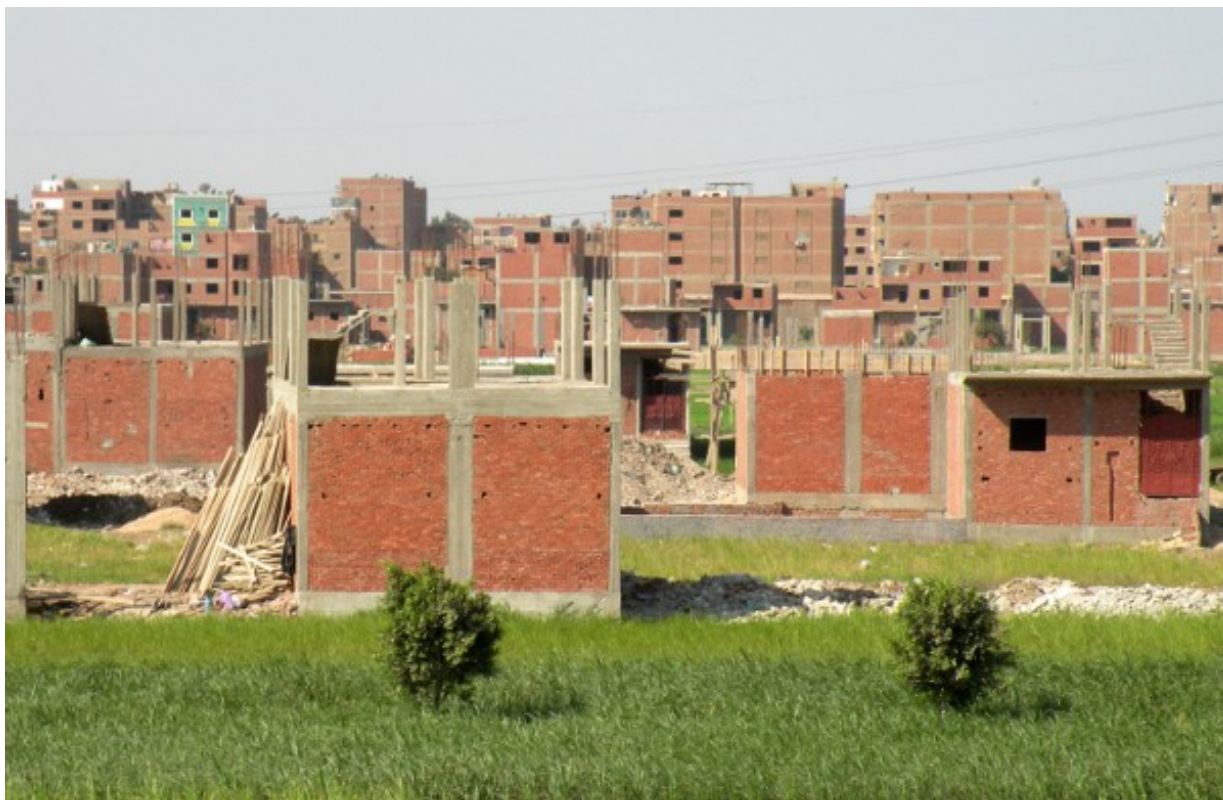
Figure 2. Agricultural land under informal conversion, North Giza, 2011

The registration of all private immovable property in Egypt is required under this legislative and institutional framework in order to be considered legally owned. Indeed, there are penalties on the books for non-registration, but these are never applied. The bureaucratic and clerical requirements of the property registration system are cumbersome and complicated, labyrinthine even, and bribes at the Shahr al-‘Aqari offices as well as at the Survey Authority are quite routine. 2 In order for a property transaction to be registered, a clear chain of titles from the last time the property was entered into the registry—usually when it had been part of a larger agricultural parcel—is required. 3 For most properties in informal urban areas, and even for most formal properties, establishing this chain, which usually goes back decades, is simply impossible. In 2005, a large USAID technical assistance project began, aimed in part at improving property registration for mortgage purposes, and an early finding was that the registry system was hopelessly flawed. One report summarized the situation as follows: “The current condition of Egypt’s real-property registration system can best be described as onerous and complex for applicants, vastly underutilized, excessively bureaucratic and complex, misunderstood and unpopular with the public, and incapable in [its] current form of promoting a real-estate mortgage finance market” (Menelaws 2005).