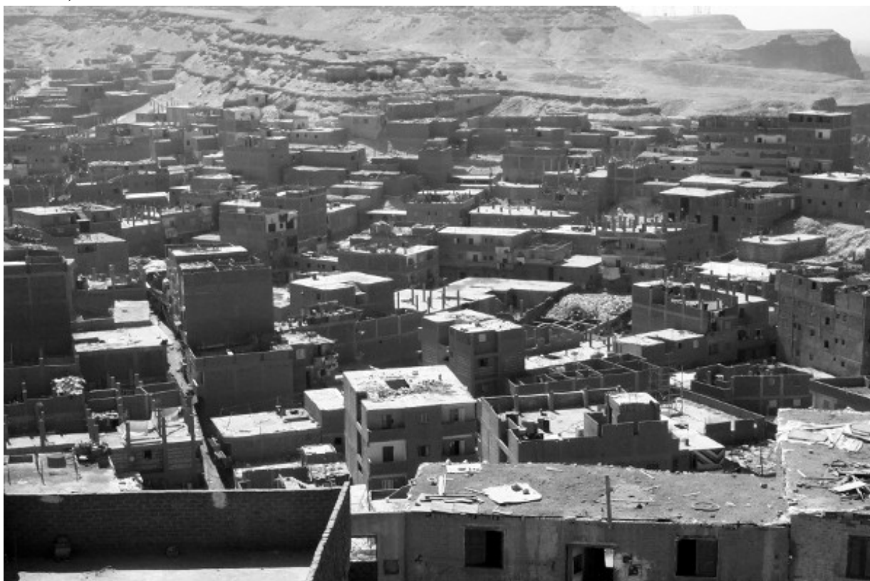
Figure 3. State land under informal conversion, Wadi Pharaon, Cairo, 2010 (mostly demolished in 2014)