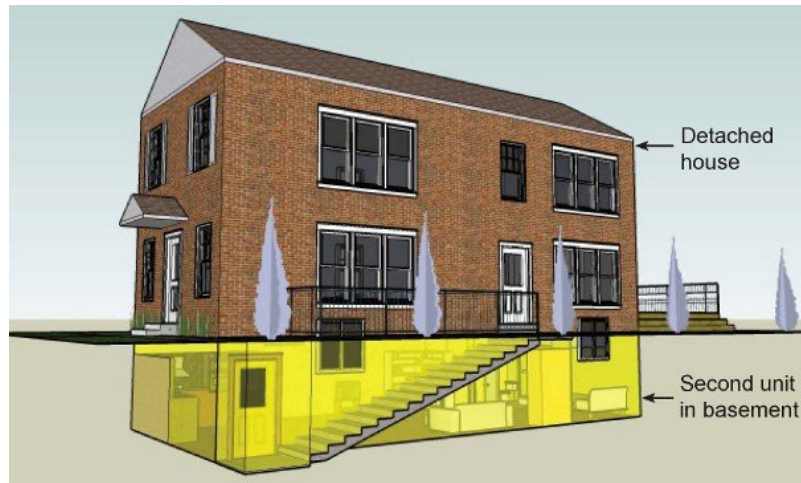
Figure 1: Diagram showing a secondary suite in the basement of a detached home